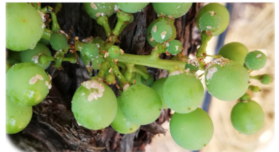
Vine Mealybug on grapes

Key crops: coffee, grape, olive, Persimmon, pomegranate and tropical fruits.